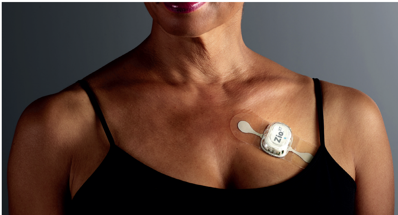
The single-use Zio patch from iRhythm in San Francisco, California, can monitor heart rate continuously for two weeks to detect irregularities.

Regulatory approval is crucial, and challenging to obtain. Hardware is largely covered by existing frameworks; algorithms are not. But there are encouraging signs that software applications can be regulated. In the past few years, the FDA has approved machine-learning technology for the diagnosis of diabetic retinopathy, the first pill with an embedded sensor (Abilify MyCite) and an app to treat opioid-use disorder (reSET-O). The FDA's pre-certification programme allows medical software from certain trusted developers to be deployed before formal evaluation.