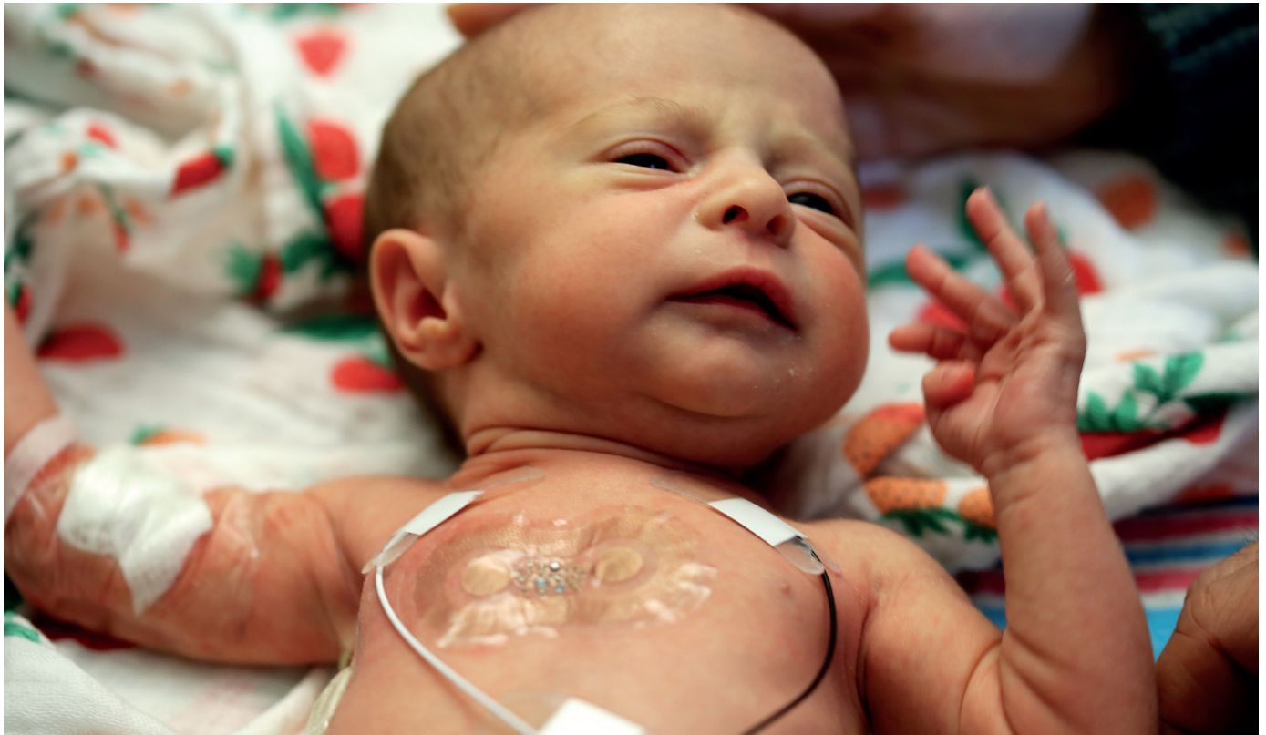
Sensors soft enough to be used on a premature baby's skin can monitor vital signs in the neonatal intensive care unit.